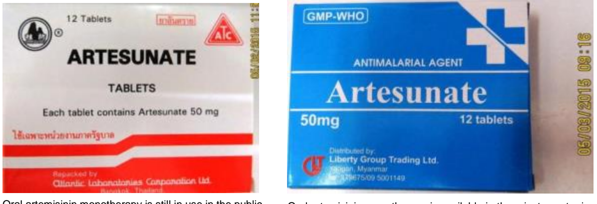
Oral artemisinin monotherapy is still in use in the public sector in Thailand. This product is manufactured by Guilin Pharm Co. Ltd and repackaged by Thailand Atlantic Labs Co. Ltd; purchased and distributed by the National Malaria Program

In addition to taking part in the sampling, PQM's role was to provide supervision and monitor the medicines quality monitoring activities in specific provincial sites in these countries. The team also provided technical guidance to country partners to improve their sampling methodology and techniques as well as their post-marketing surveillance practices.