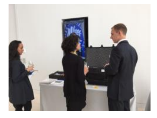
PQM exhibited on MQM and the GPHF Minilab at a TB World Day event

During the period under review, PQM supported one company to submit dossiers for Kanamycin 0.5 g and Kanamycin 1.0 g FPPs to the WHO PQ Programme which have been accepted for review. PQM will continue to support manufacturers to address the global need for kanamycin as a critical medicine for the management of TB.